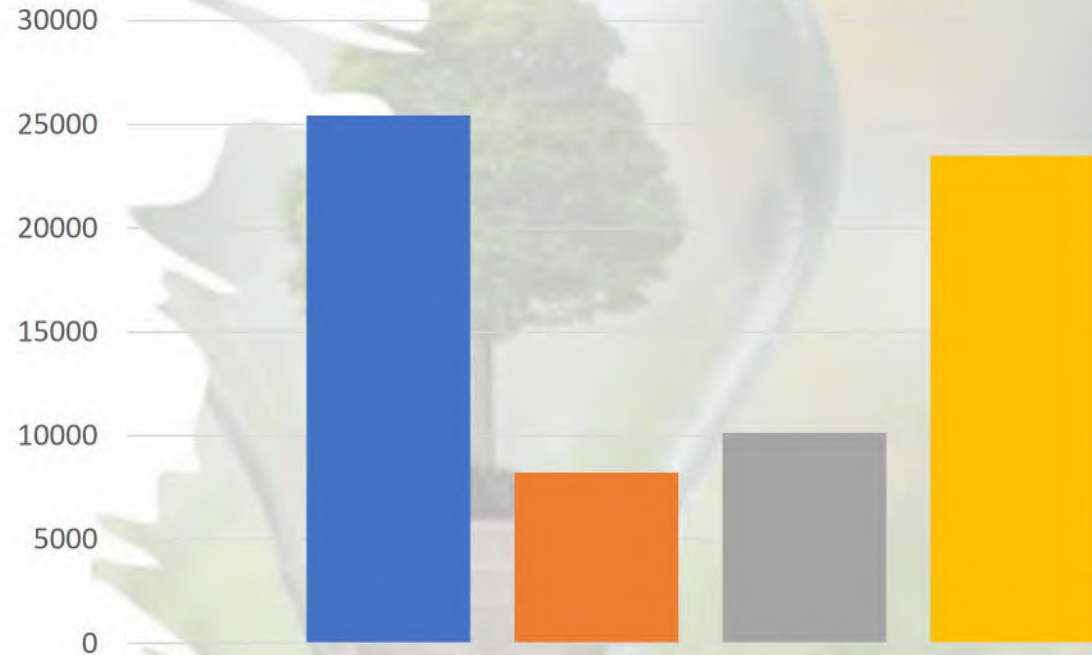
Number of Visitors – Jan-Nov 2024